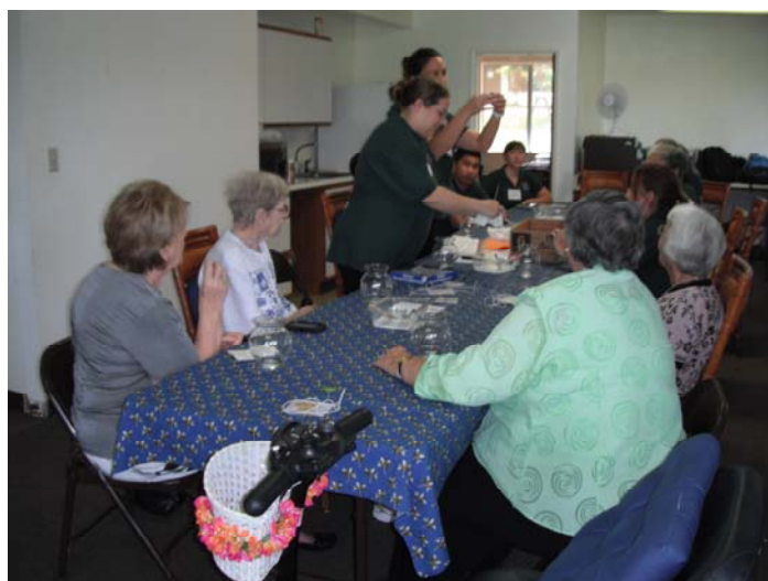
UH Nursing students assisting with some of our Seniors at our Thursday week Senior Club in Sato Cottage.