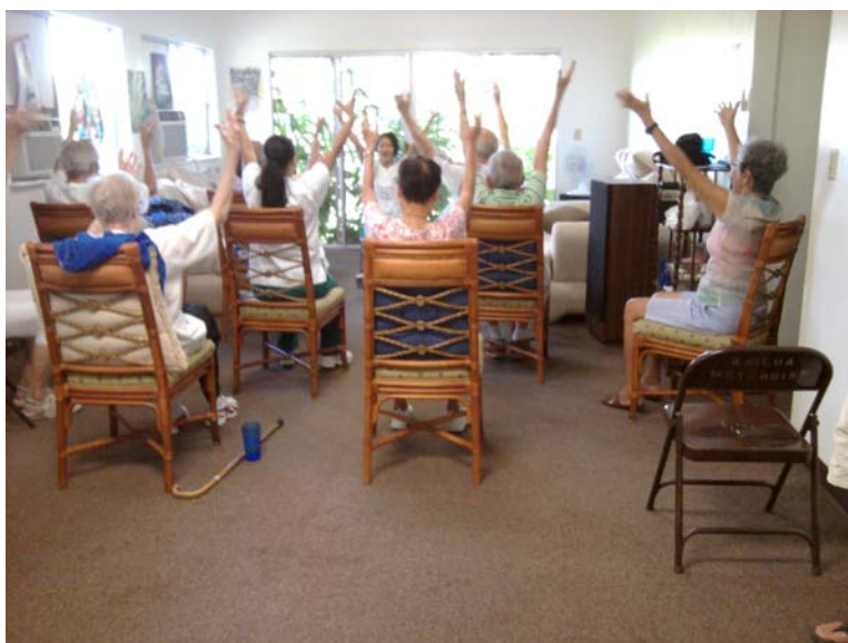
Everyone enjoying sitting Zumba!