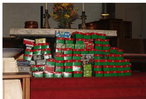
KUMC shoe boxes sitting on the altar